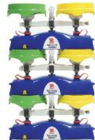
Stack your balances to maximize storage space when not in use!