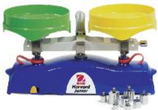
Includes an 8-piece, metal mass set